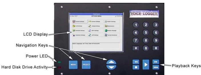
Total Recall VR LinX Altus: Control Panel

All Specifications Subject To Change Without Notice