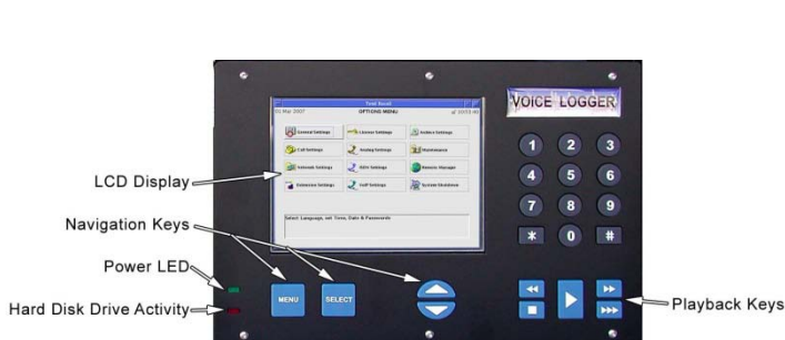
Total Recall VR LinX Neos: Control Panel

All Specifications Subject To Change Without Notice